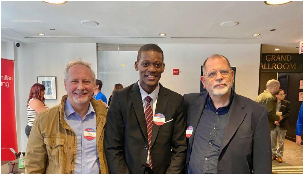
Macmillan Conference (Fall 2024)

activities, co-authoring papers with students, and submitting publications provide enough evidence to support achievement in teaching and research. My teaching evaluations and class material also provide evidence in the quality of my work as a professor.